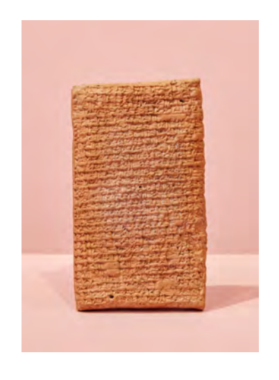
Middle Babylonian Terracotta Cuneiform Tablet describing arrangements for a marriage, 1281 BCE