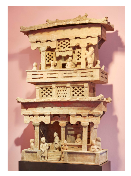
Painted Terracotta Model of a House China, 0 - 300CE