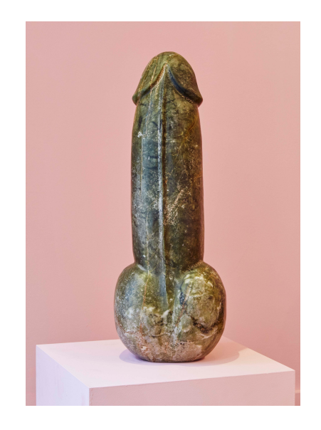
Colossal Stone Phallus, Costa Rica, c. 500 BCE - 1000 CE