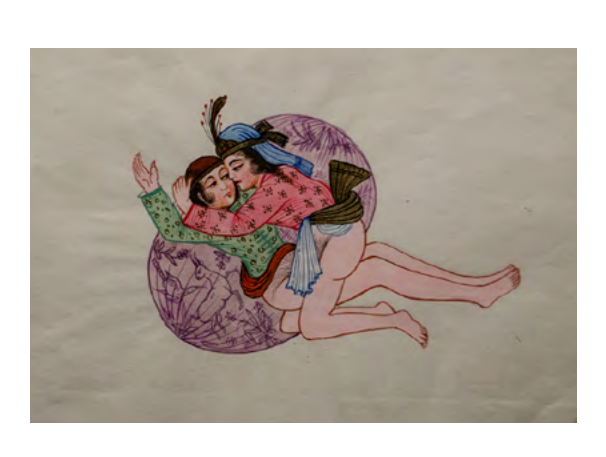
124 - Late Mughal Empire Erotic Manuscript / Painting Inspired by the Kama Sutra