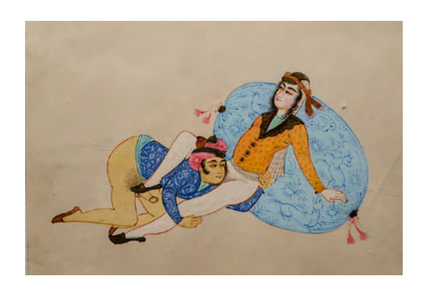
126 - Late Mughal Empire Erotic Manuscript / Painting Inspired by the Kama Sutra