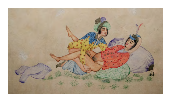
158 - Late Mughal Empire Erotic Manuscript / Painting Inspired by the Kama Sutra