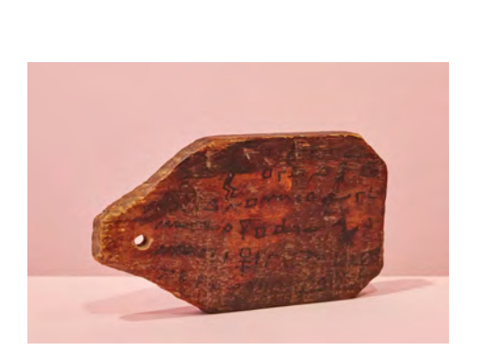
Egyptian Wooden Inscribed Mummy Tag c. 200 BCE - 200 CE