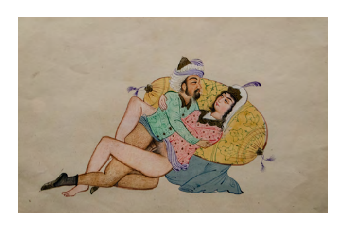
133 - Late Mughal Empire Erotic Manuscript / Painting Inspired by the Kama Sutra