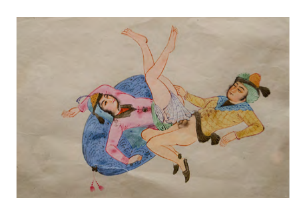
139 - Late Mughal Empire Erotic Manuscript / Painting Inspired by the Kama Sutra