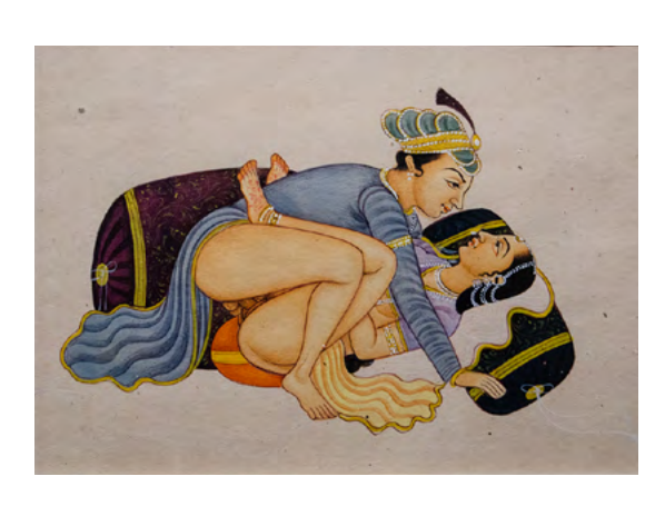
149 - Late Mughal Empire Erotic Manuscript / Painting Inspired by the Kama Sutra