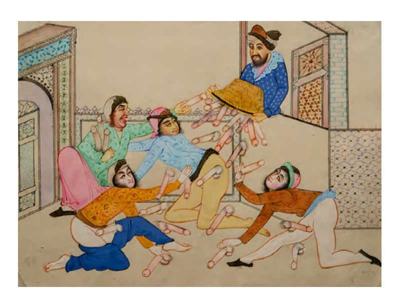
147 - Late Mughal Empire Erotic Manuscript / Painting Inspired by the Kama Sutra