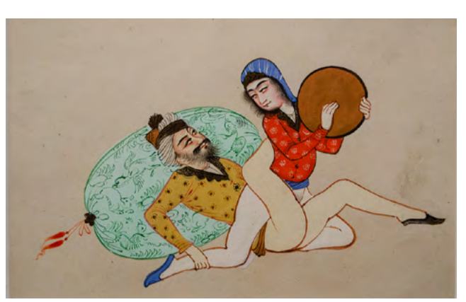
108 Late Mughal Empire Erotic Manuscript / Painting Inspired by the Kama Sutra